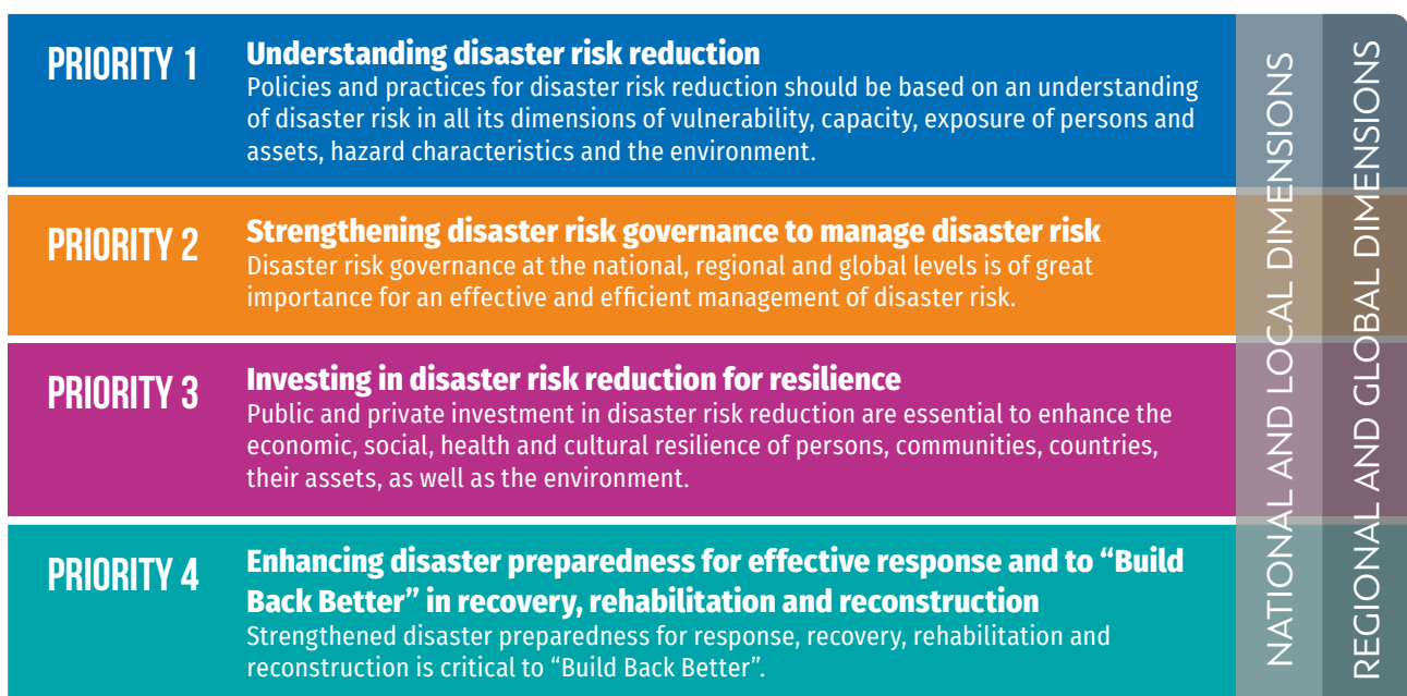
Figure 1. The Sendai Framework for Disaster Risk Reduction 2015–2030 has four priorities for action that encompass activities at local, national, regional and global levels.

Early warning will also contribute to sustainable development. The 2030 Agenda for Sustainable Development addresses early warning and gives it an important role across the Sustainable Development Goals, such as in food security, healthy lives, resilient cities, environmental management and climate change adaptation. The Paris Agreement stipulates early warning systems as one of